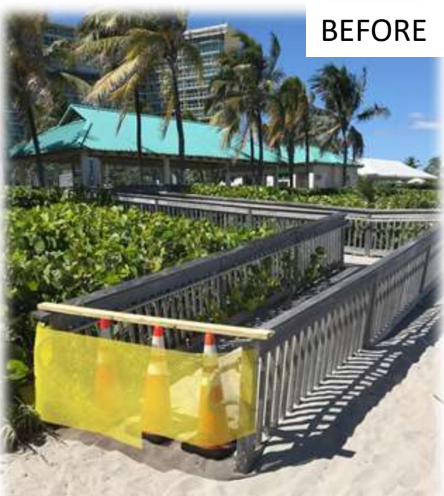
Non ADA compliant access ramp