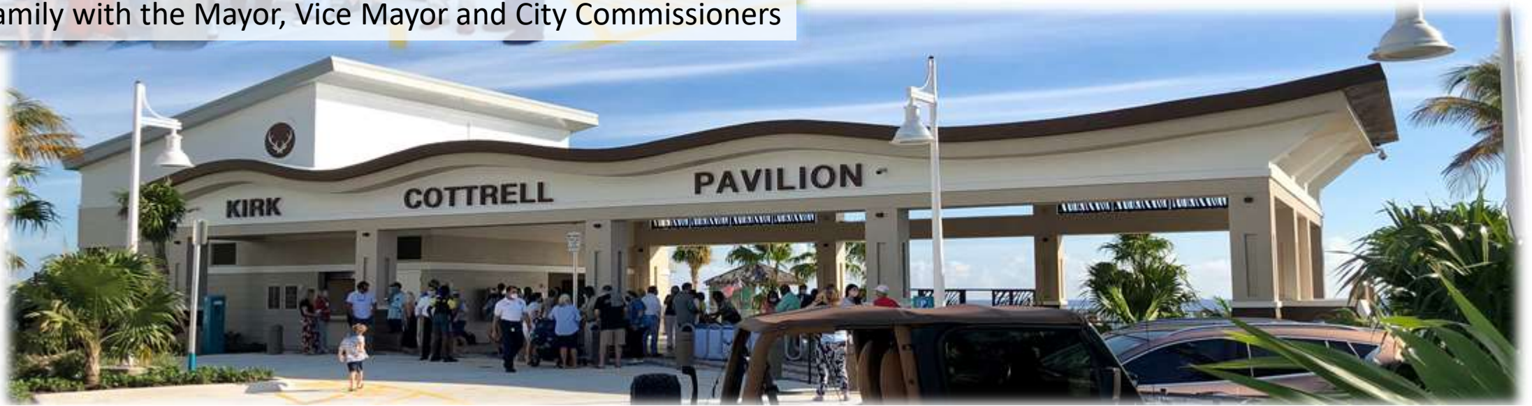
Cottrell Family with the Mayor, Vice Mayor and City Commissioners