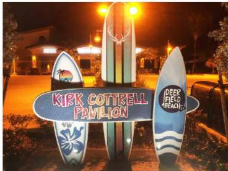
An artistic surfboard display welcomes visitors to the Kirk Cottrell Pavilion at Deerfield Beach.