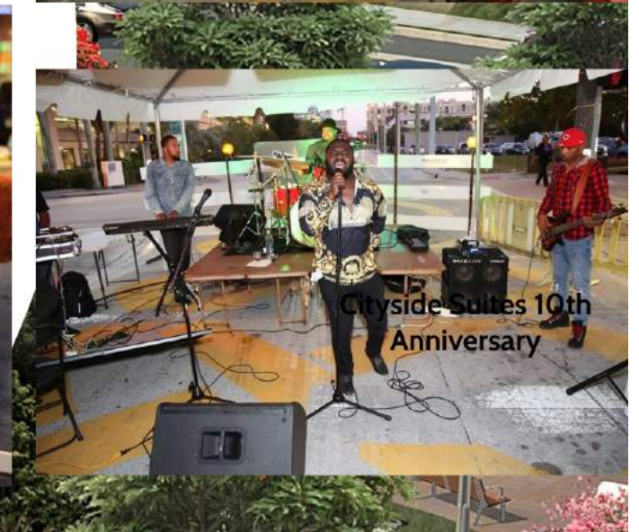
Cityside Suites 10th Anniversary