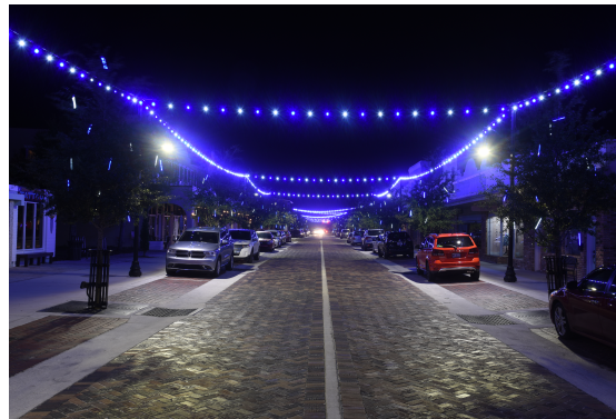
New York Avenue $1,950,000