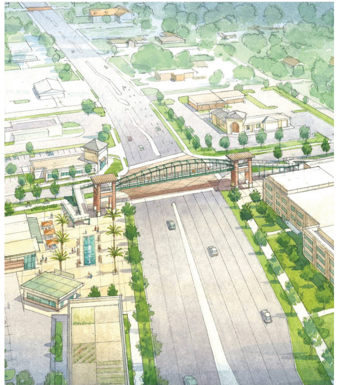
Envision Concept Plan