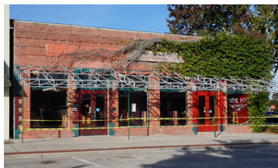
Makinson Building Acquisition $417,026.00