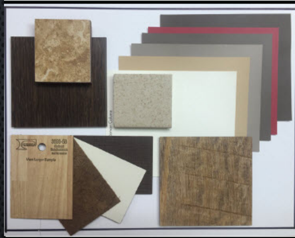
Interior Color Options