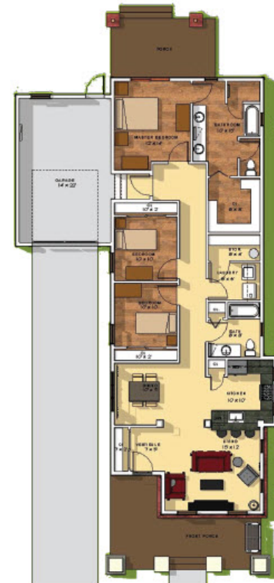
Proposed Three Bedroom Floor Plan