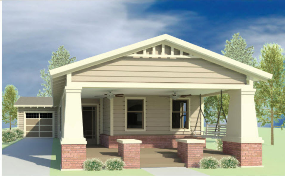
Three Bedroom | Single Family Home