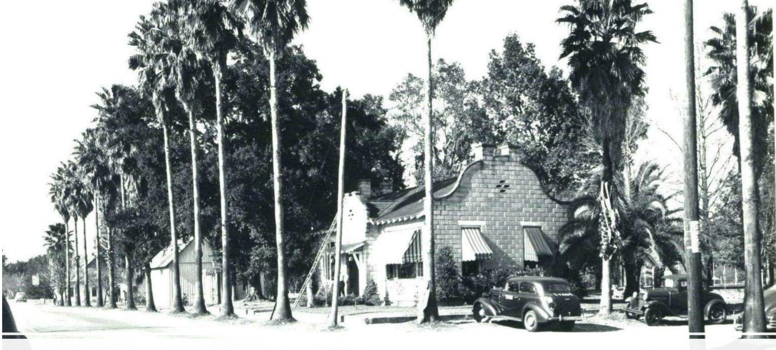
Inspiration: Palm Tree colonnade in High Springs c. 1920