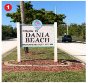
East Dania Beach Blvd. Eastbound before bridge Cut off at grade.