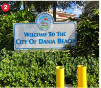
Northeast of intersection at Sheridan St. & S.E. 5th Ave. Northwest of intersection at Sheridan St. Remove foundation.