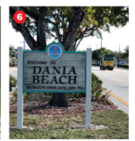
Eastbound Griffin Rd. East of SW 34th Terrace Cut off at grade.