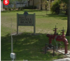
Southwest of intersection of SW 46th Ct. & SW 30th Ave.