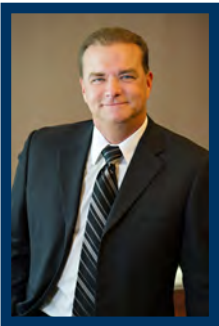
MAYOR Eric Seidel

The Oldsmar City Council shall be the Community Redevelopment Agency. The Community Redevelopment Agency shall have all powers enumerated under F.S.CH 163, PT.III, and as delegated by the Pinellas County Board of County Commissioners by Pinellas County Resolution No. 95-195.