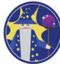
CRA MASTER WIZARD