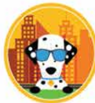
CITY DATA DOG