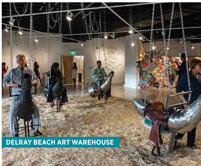
DELRAY BEACH ART WAREHOUSE