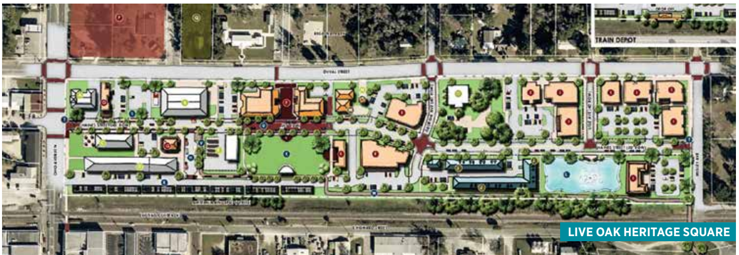
LIVE OAK HERITAGE SQUARE