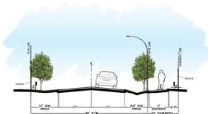
TYPICAL SECTION 50' ROW SCALE: A.T.S.