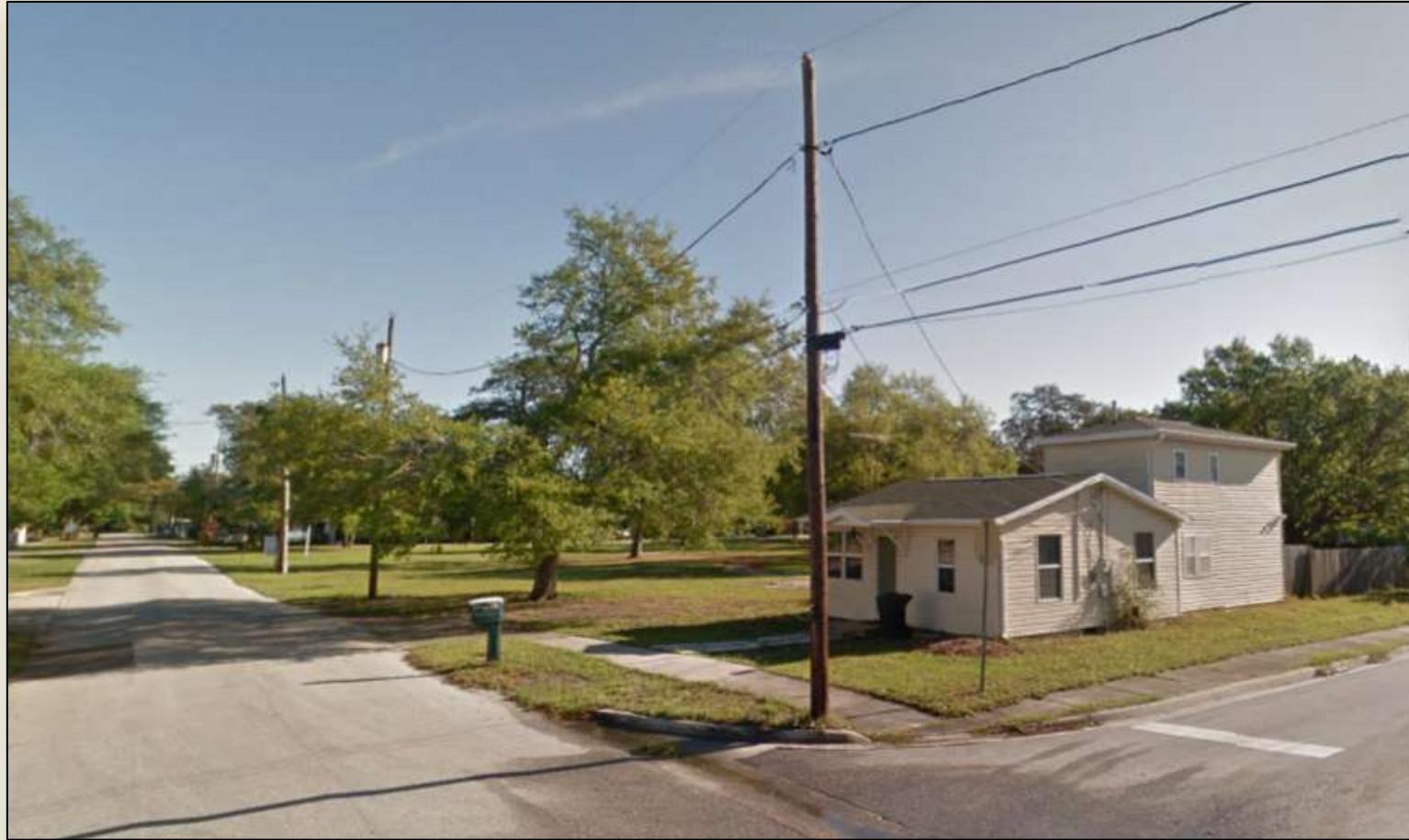
A “before” view of the property at 158 Ridge Road looking in a northeast direction from the corner of 1 st Ave NW and Ridge Road Northwest.