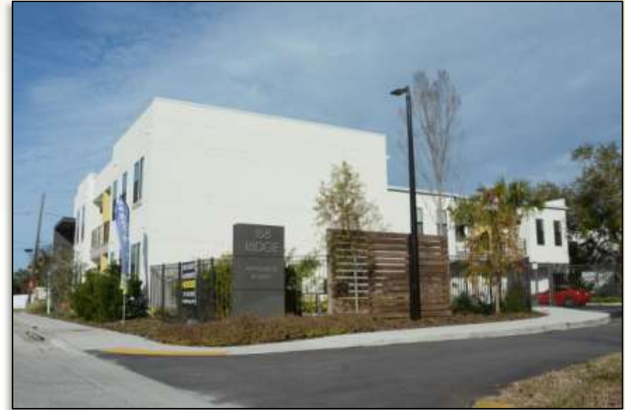
A “before” and “after” view at the rear of the property and adjoining alley from 1 st Avenue Northwest looking towards a northwest direction.