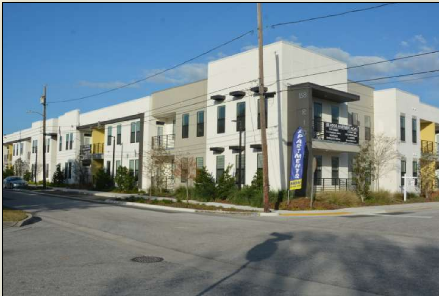
An "after" view of the property at 158 Ridge Road looking in a northeast direction from the corner of 1 st Ave NW and Ridge Road Northwest.