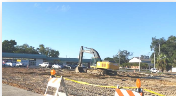
Old Griggs Gas Station Before & After