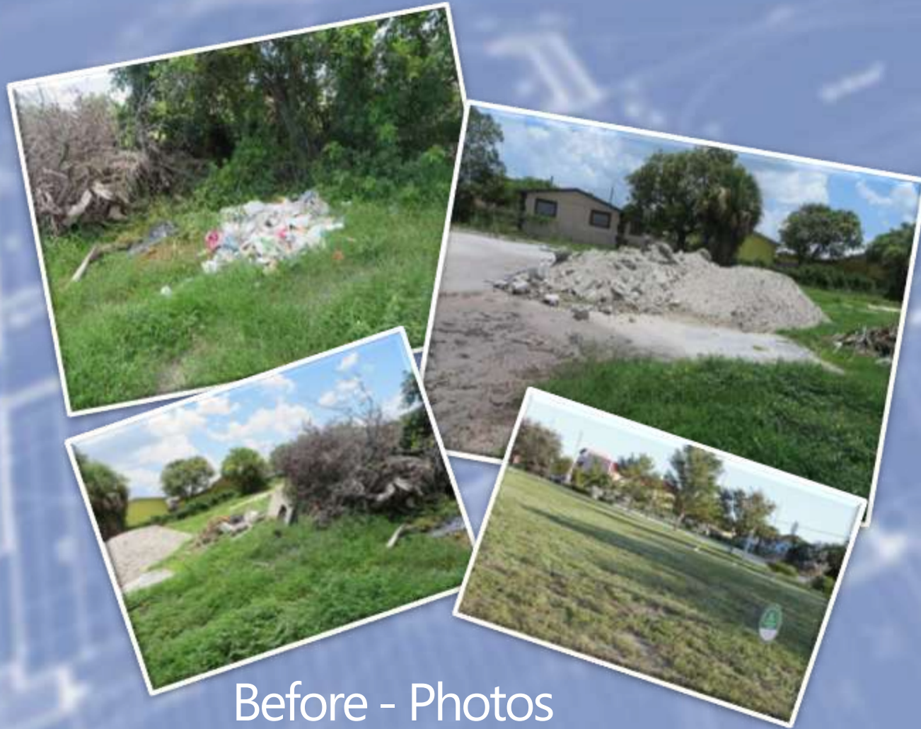
Before - Photos