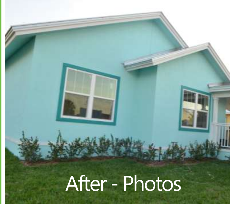
After - Photos