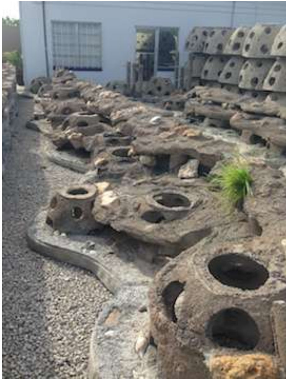
Reef Balls before assembly, at Reef Innovations facilities in Sarasota. Photo by Carl Mario Nudi, 2016.