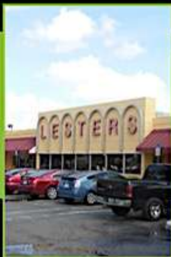
Lester's Diner Before