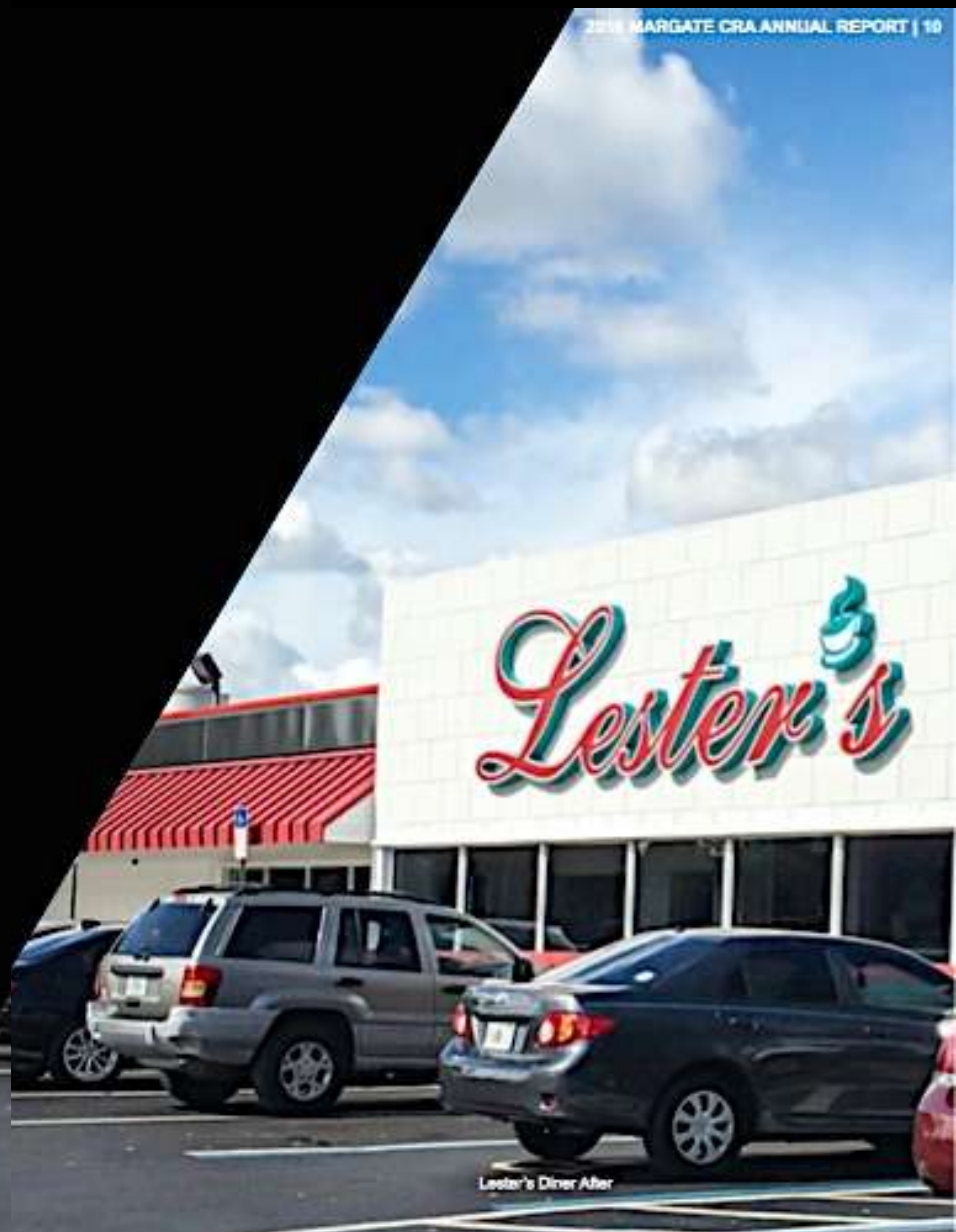
Lester's Diner After