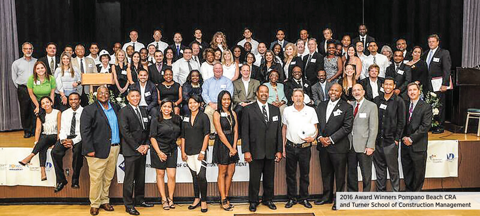
2016 Award Winners Pompano Beach CRA and Turner School of Construction Management