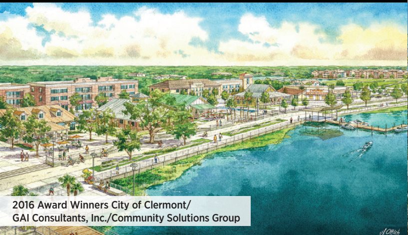
2016 Award Winners City of Clermont/ GAI Consultants, Inc./Community Solutions Group