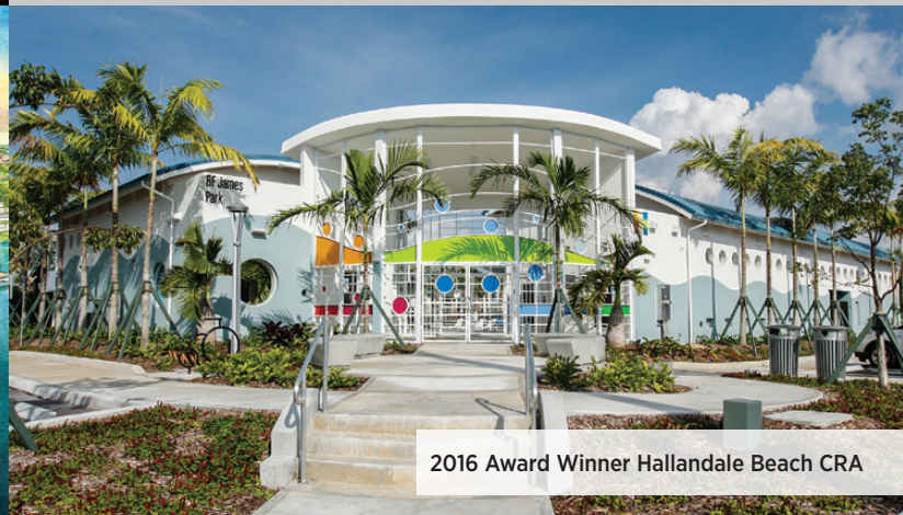
2016 Award Winner Hallandale Beach CRA