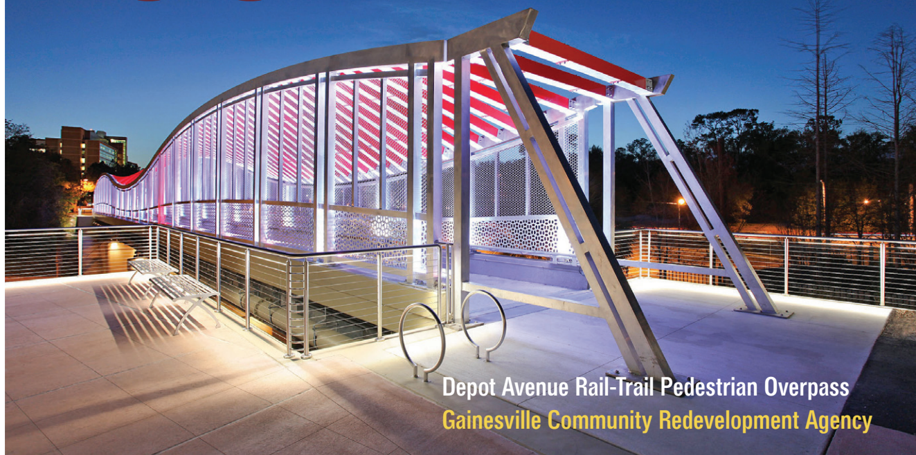
Depot Avenue Rail-Trail Pedestrian Overpass Gainesville Community Redevelopment Agency