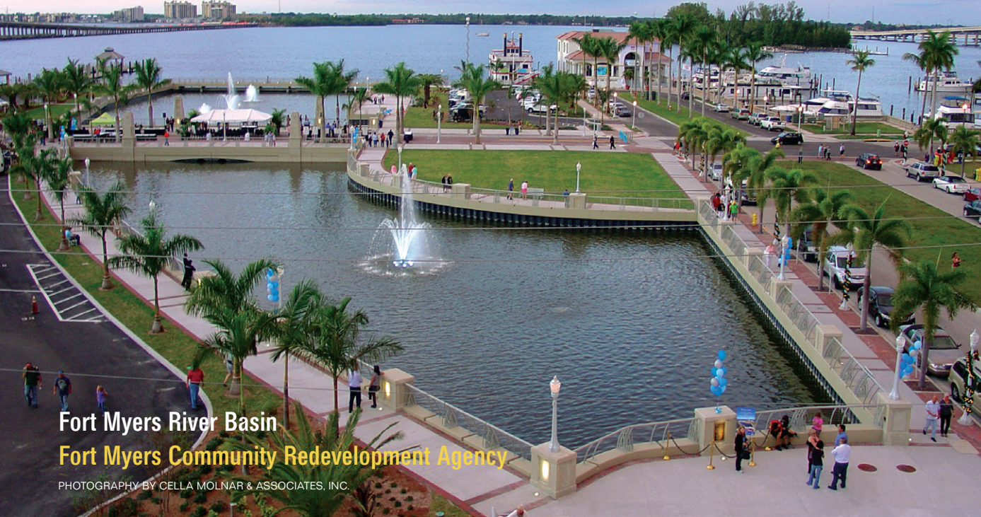
Fort Myers River Basin Fort Myers Community Redevelopment Agency