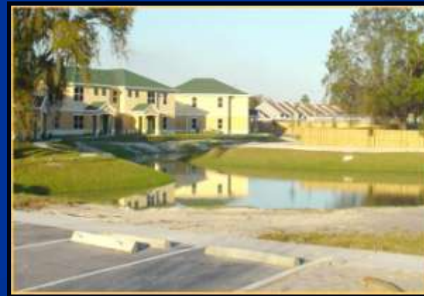
Former Robbins Manufacturing Facility