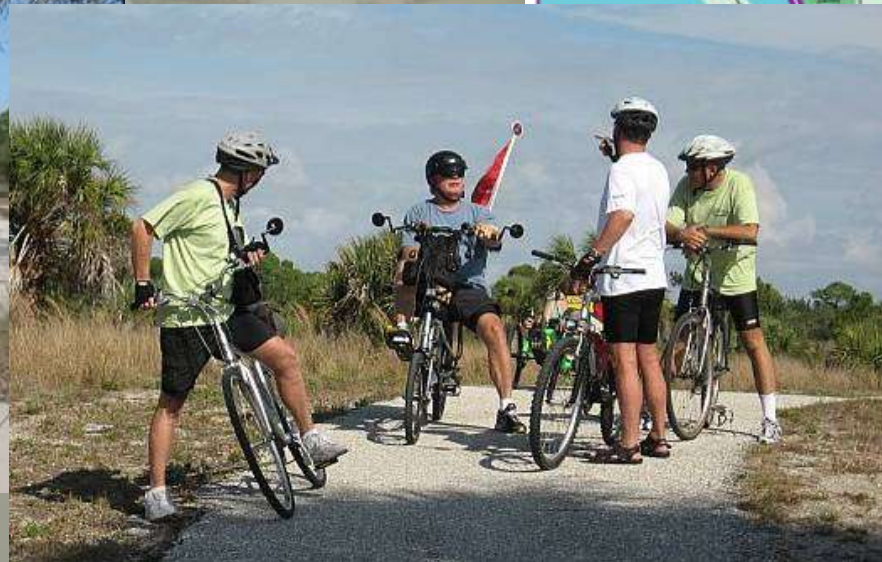
The Legacy Trail