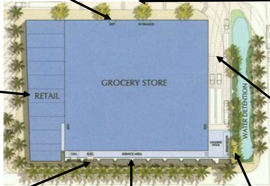
Electric Behind Doors