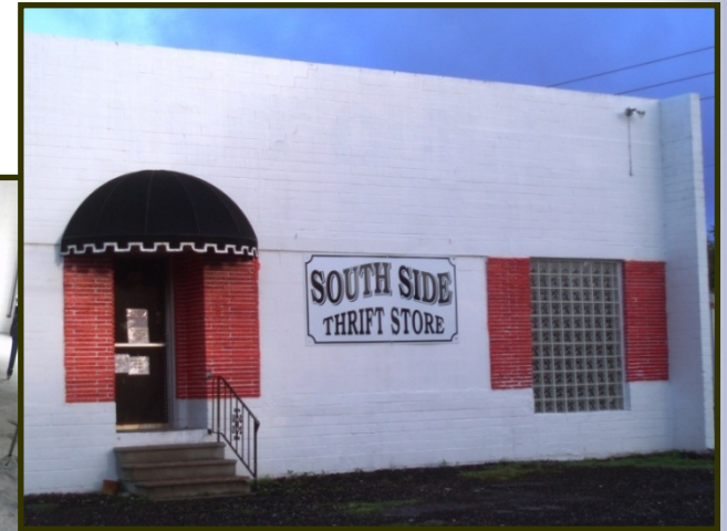
Southside Thrift Store