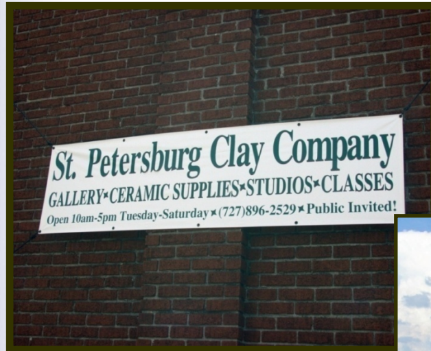
St. Petersburg Clay Company