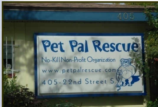
Pet Pal Rescue