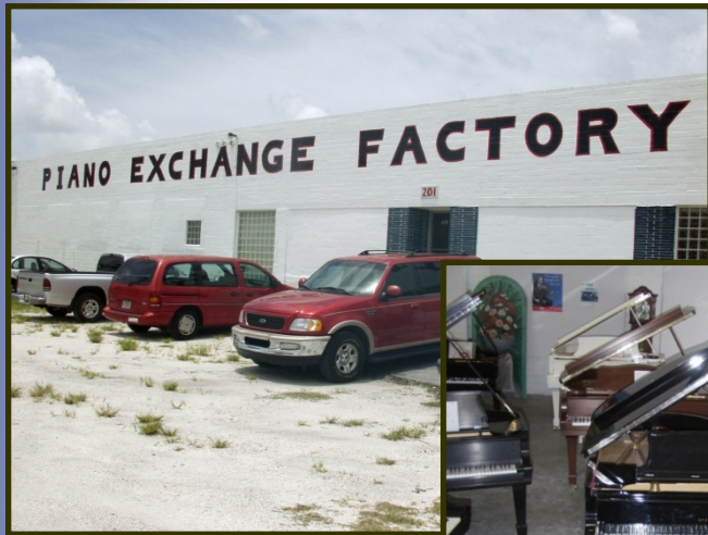
Piano Exchange Factory