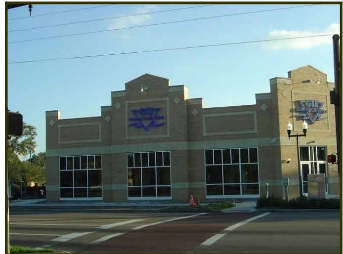
GTE Credit Union A "Big 4" Asset