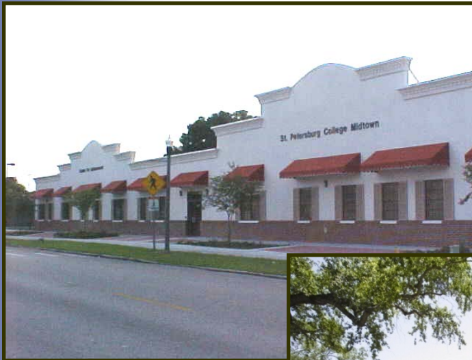
St. Petersburg College Midtown