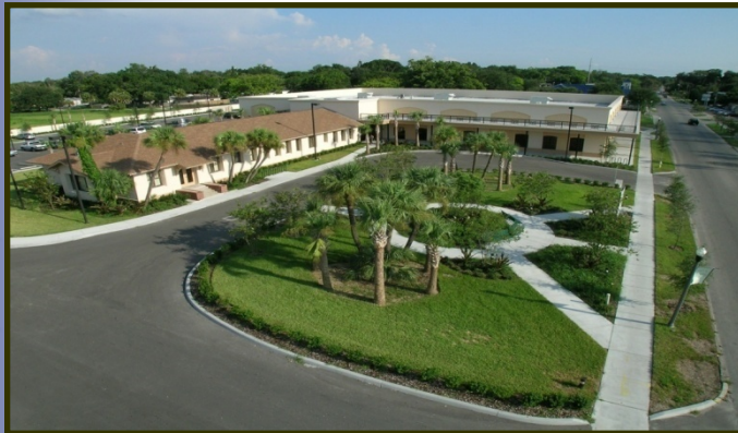
Johnnie Ruth Clarke Health Center