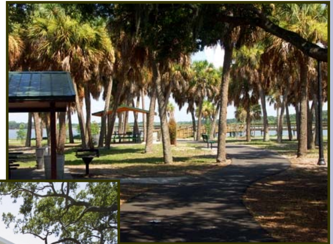
Dell Holmes Park