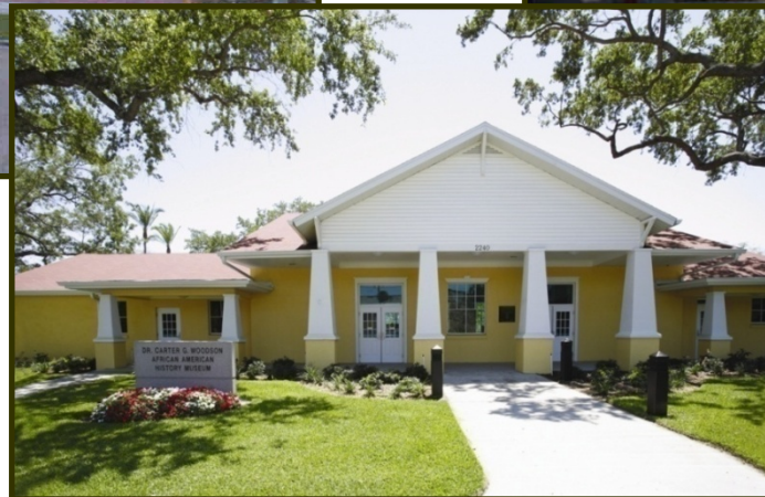
Carter G. Woodson Museum