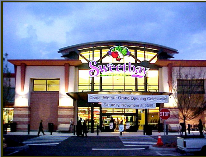
Sweetbay Grocery Store A "Big 4" Asset