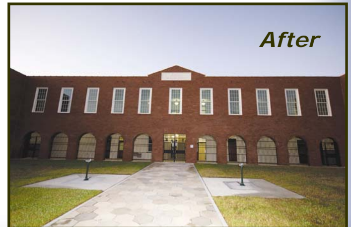
Jordan Elementary School