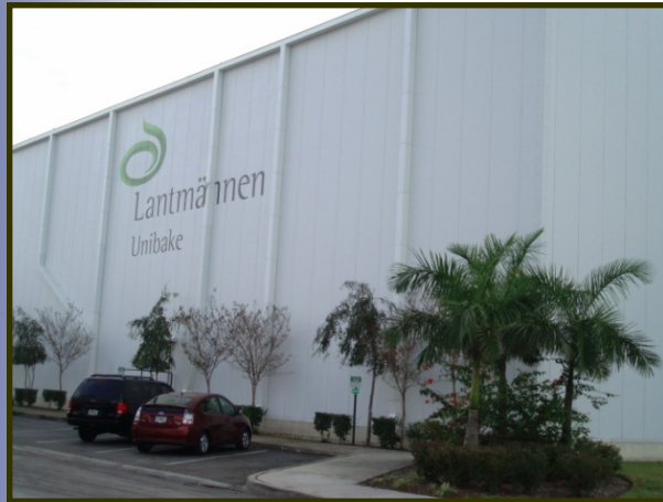
Retention of Lantmannen Uni-bake (formerly Euro-Bake)