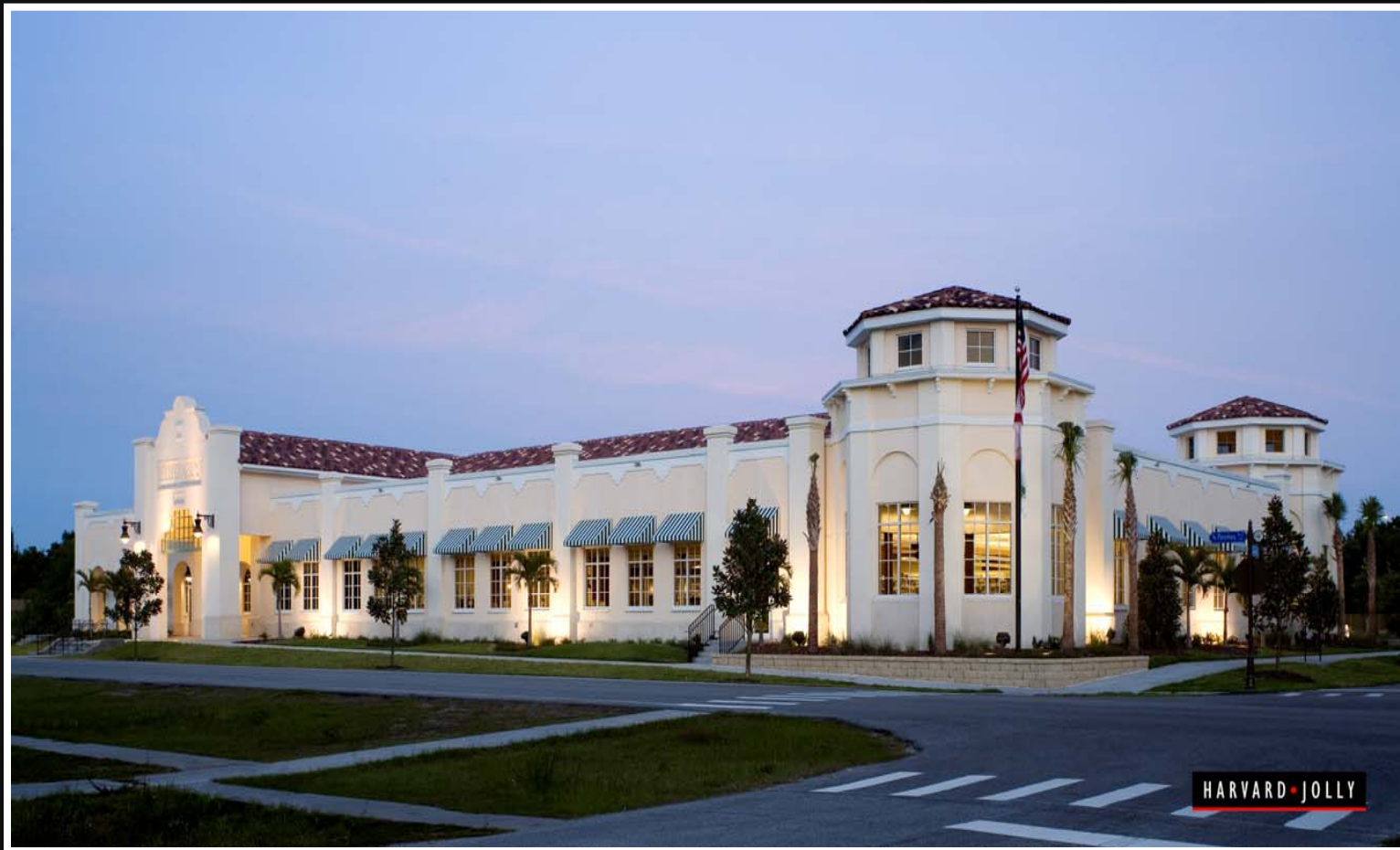
Oldsmar Public Library City of Oldsmar