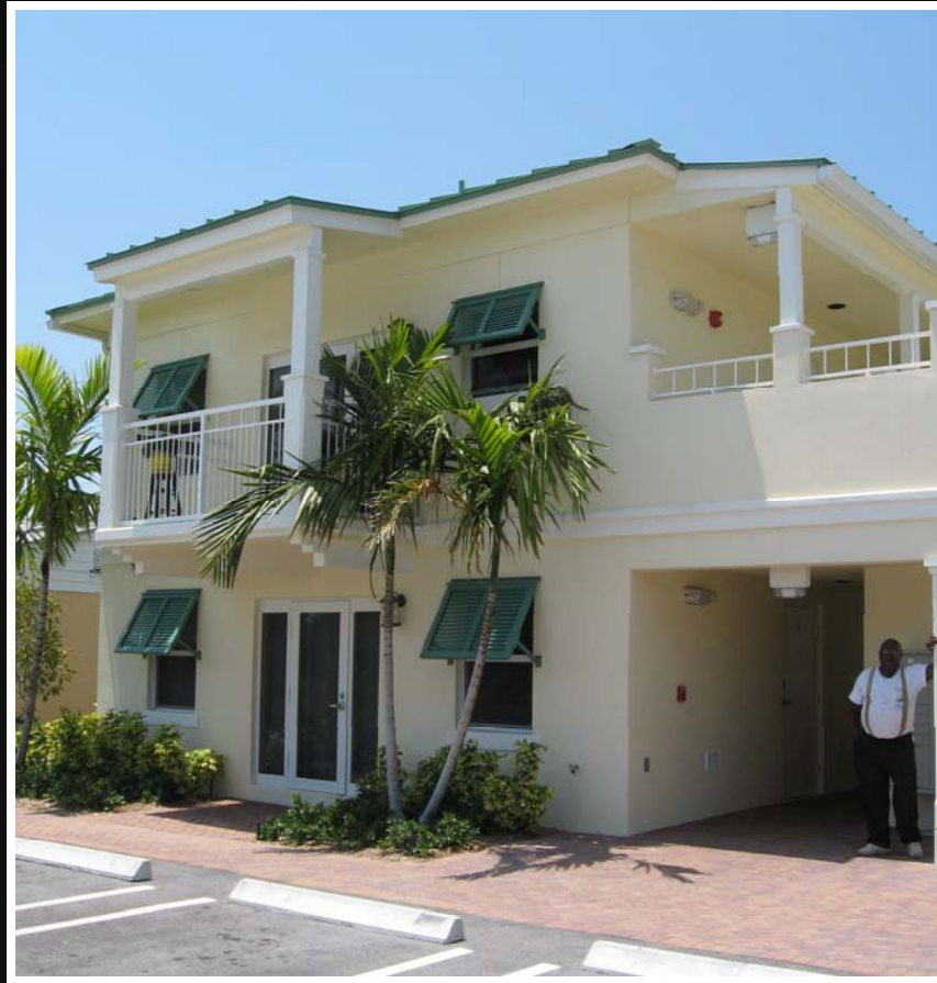
La France Apartments Delray Beach Community Redevelopment Agency