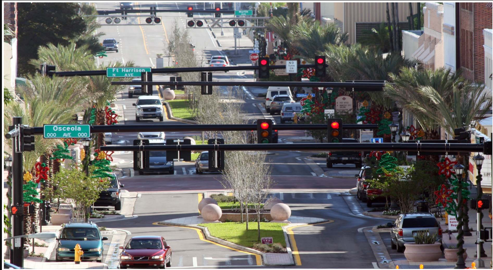
Cleveland Street Streetscape City of Clearwater