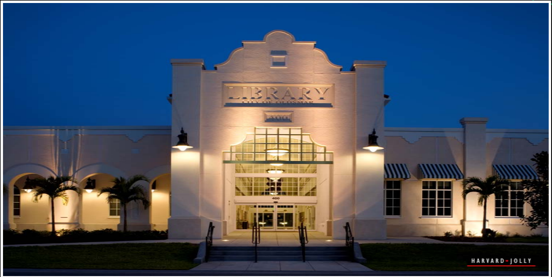
Oldsmar Public Library City of Oldsmar