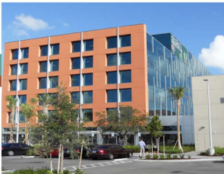
WEXFORD SCIENCE + TECHNOLOGY, MIAMI

2 PROJECTS TOTAL $15.8 million FCLF NMTC ALLOCATION $17.1 million