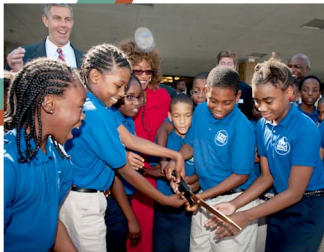
KIPP SCHOOL JACKSONVILLE

TOTAL PROJECT $116.8 million FCLF NMTC ALLOCATION $5.7 million