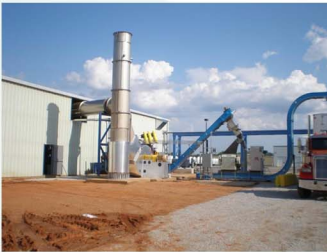
QUITMAN TORREFACTION QUITMAN, MS

TOTAL PROJECT $18.5 million (estimated) FCLF NMTC ALLOCATION $10 million