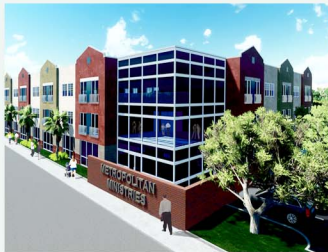
METROPOLITAN MINISTRIES TAMPA

TOTAL PROJECT $37.4 million FCLF NMTC ALLOCATION $20 million