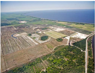
LAKE POINT RESTORATION MARTIN COUNTY

TOTAL PROJECT $16.6 million FCLF NMTC ALLOCATION $12.5 million