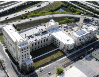
CAMILLUS HOUSE MIAMI

TOTAL PROJECT $30.2 million FCLF NMTC ALLOCATION $16 million