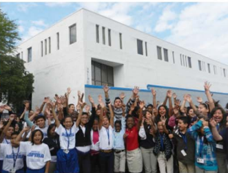
ASPIRA OF FLORIDA MIAMI

ASPIRA of Florida is a non-profit organization operating charter schools, after-school programs, and community outreach programs in South Florida, with an emphasis on education of Latino and other minority youth. Using the NMTC Program, ASPIRA has funded 2 projects: ASPIRA North, a $7.4 million renovation and expansion of a charter school; and ASPIRA Eugenio Maria de Hostos, an $8.4 million purchase and renovation of a 60,000 square foot building. The ASPIRA schools serve primarily low-income children, with over 85% of their students Title I qualified. Acquisition and renovation of these buildings allowed the schools to increase enrollment, by 100% in the first project and by 70% in the second. Through the NMTC structure, ASPIRA will receive additional equity funding at the end of each 7-year loan, allowing the organization to use less of its own equity. Other benefits include lower-than-market blended interest rates and lower debt service coverage requirements.