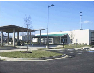
NEW MANCHESTER FLATS II RICHMOND, VA

TOTAL PROJECT $50.3 million FCLF NMTC ALLOCATION $3.5 million