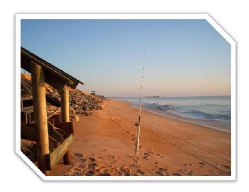
Early morning light captures a lone fishing pole south of the Flagler Beach Pier. ATV tracks, left by the ever vigilant Volunteer Turtle Patrol, attest to the city's commitment to protect endangered sea turtles.

Our goal is as stated: to provide a maintenance program for the CRA and implement future multi-modal projects.