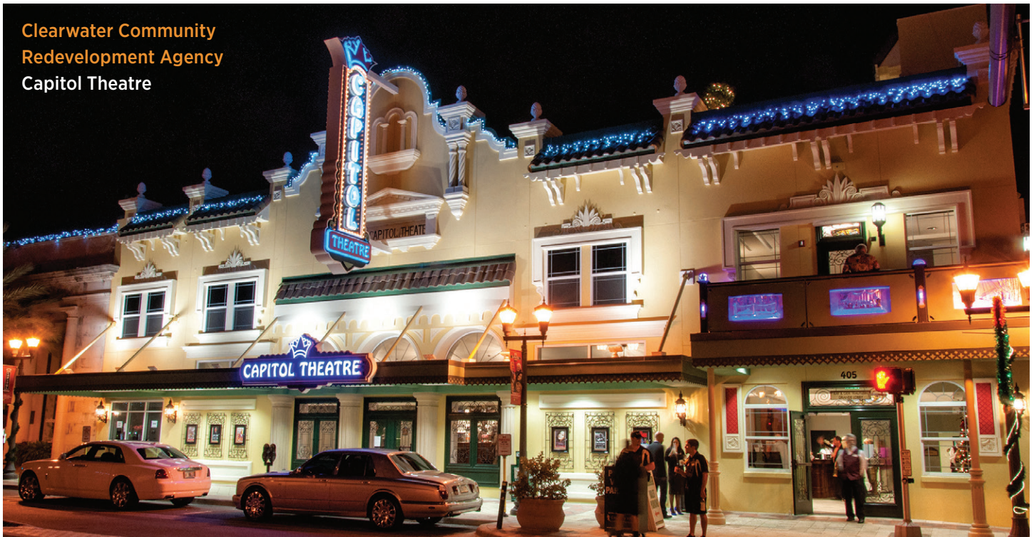
Clearwater Community Redevelopment Agency Capitol Theatre

This event is recognized by the International Economic Development Council (IEDC) as a professional development event that counts toward the recertification of Certified Economic Developers (CEdD).