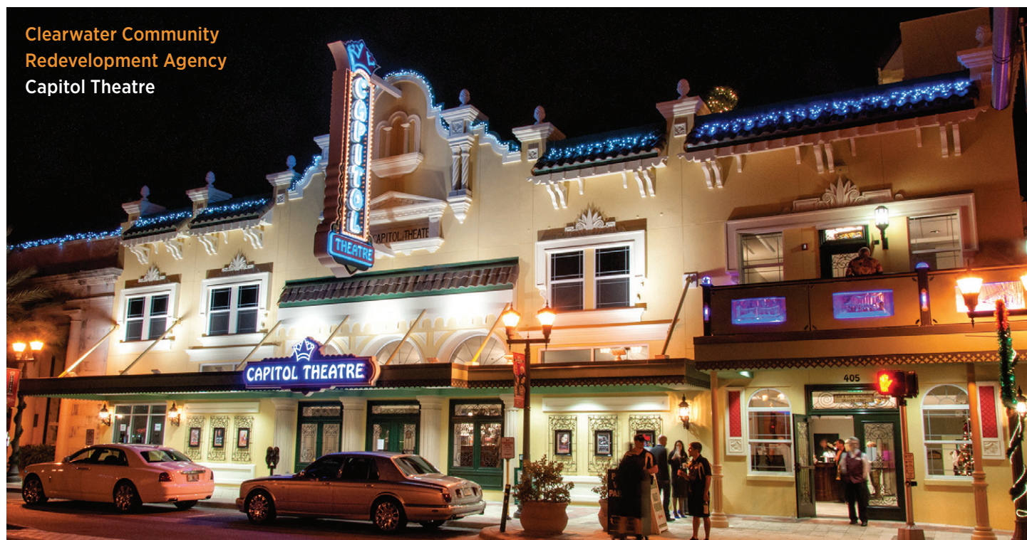
Clearwater Community Redevelopment Agency Capitol Theatre

This event is recognized by the International Economic Development Council (IEDC) as a professional development event that counts toward the recertification of Certified Economic Developers (CEdD).