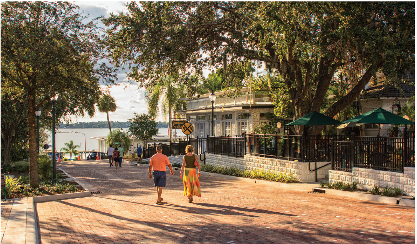
Downtown Streetscape Improvement Program City of Mount Dora CRA and Burkhardt Construction, Inc.