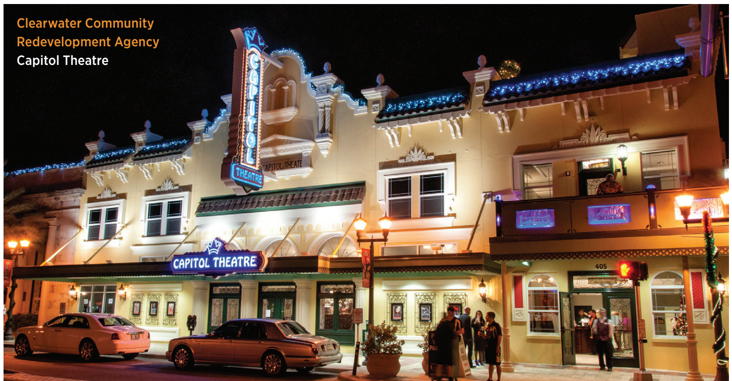
Clearwater Community Redevelopment Agency Capitol Theatre

This event is recognized by the International Economic Development Council (IEDC) as a professional development event that counts toward the recertification of Certified Economic Developers (CEdD).