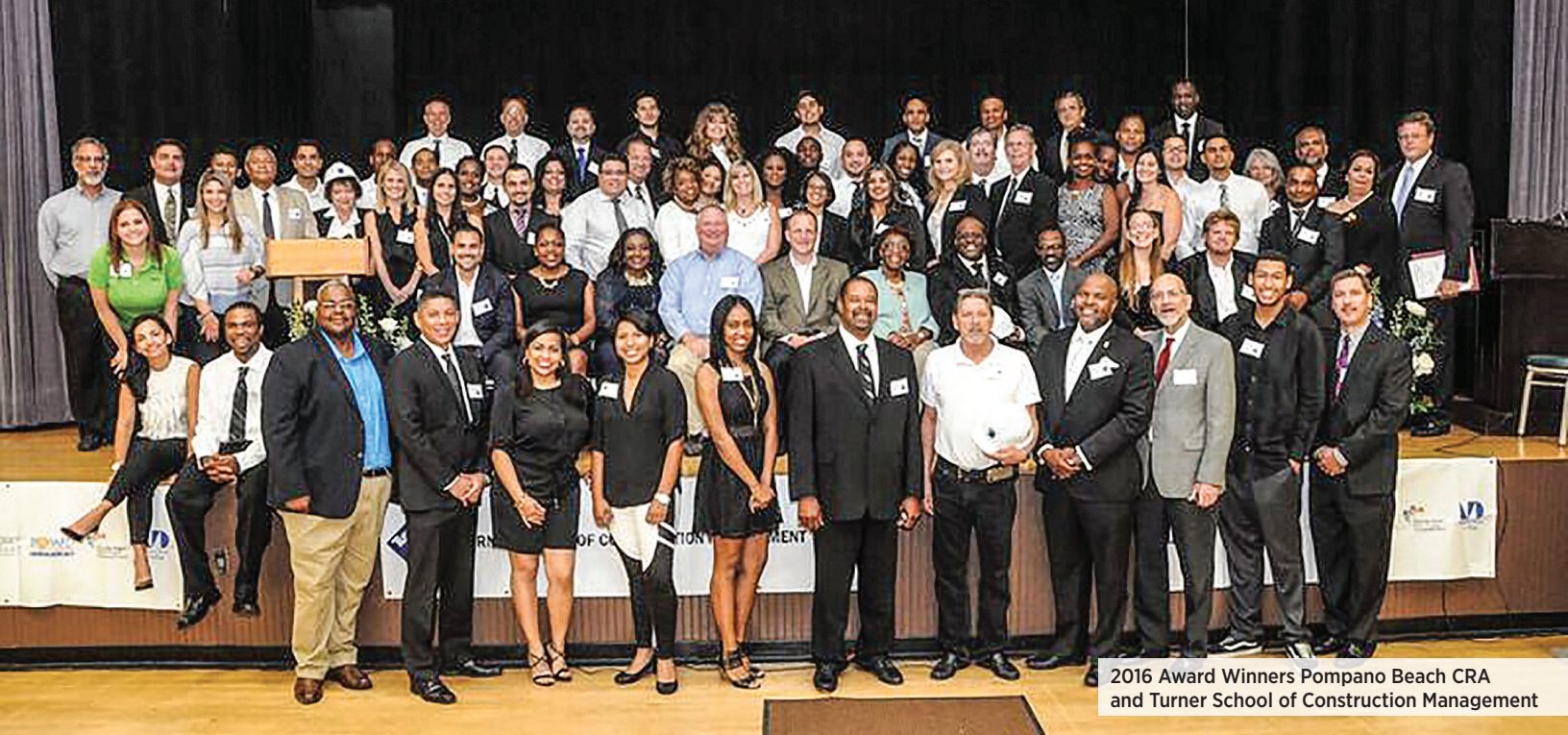
2016 Award Winners Pompano Beach CRA and Turner School of Construction Management