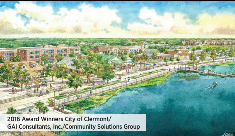
2016 Award Winners City of Clermont/ GAI Consultants, Inc./Community Solutions Group