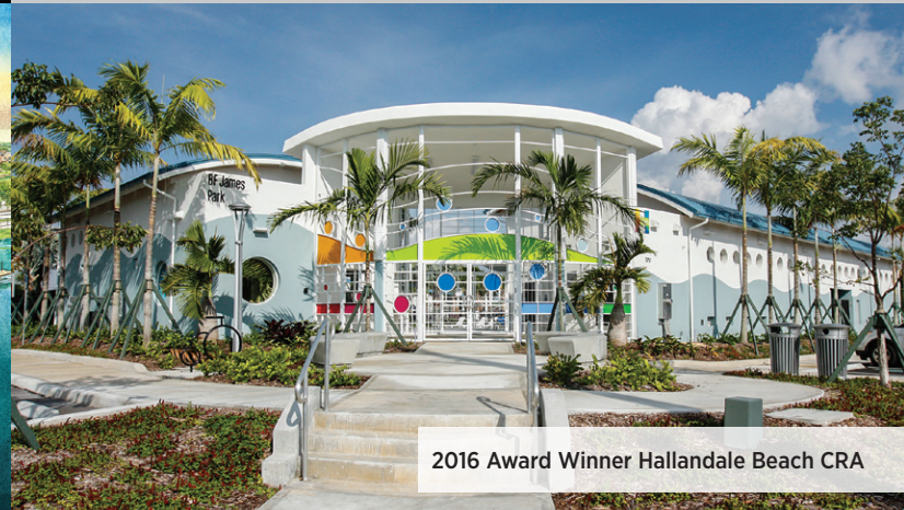
2016 Award Winner Hallandale Beach CRA

FLORIDA REDEVELOPMENT ASSOCIATION 301 S. Bronough Street, Suite 300, Tallahassee, FL 32302-1757 (800) 342-8112 • (850) 222-9684