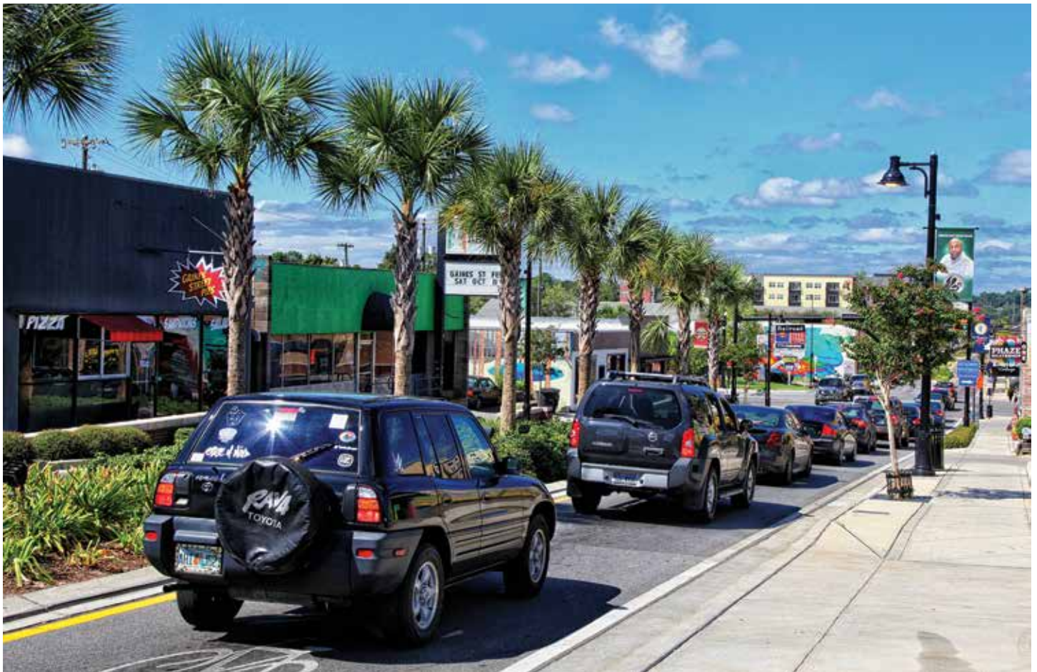
Tallahassee Community Redevelopment Agency/Genesis Gaines Street Revitalization

Diana Wolfson , MSM, Hallandale Beach CRA