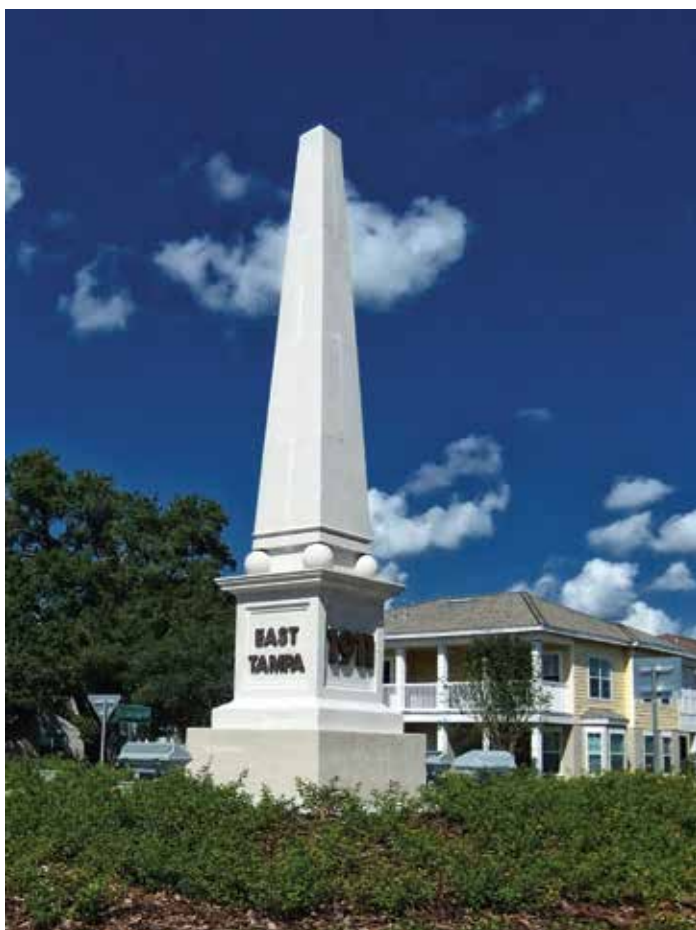
City of Tampa, East Tampa Community Redevelopment Agency

North 22nd Street Beautification and Street Enhancement Project