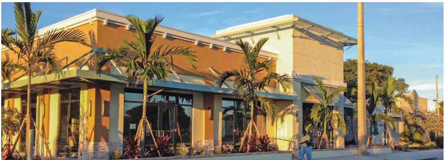
Pompano Beach Community Redevelopment Agency/Redevelopment Management Associates 731 Retail Shoppes

This event is recognized by the International Economic Development Council (IEDC) as a professional development event that counts toward the recertification of Certified Economic Developers (CEcD).